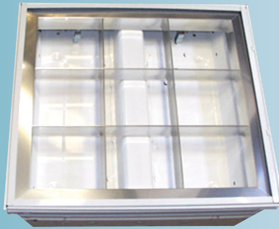
Louvers are shown in recessed fixture